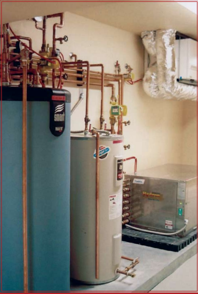
BUFFER TANKS > Pump with the storage tanks for domestic hot water and hydronic hot water.