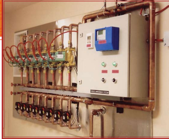
BEHIND THE SCENES > Pumps, valves and controls for the individual room zones in the home.

As GSHP's become more common place, contractor's costs will continue to drop and apprehension about dealing with an unknown product will also diminish. Check with your local utility company to see if loop field installation incentives exist in your area. There are many grants and rebates already in existence in many counties around the United States. ■■